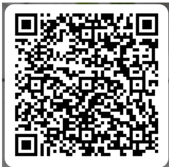
Planning for 2025 Survey