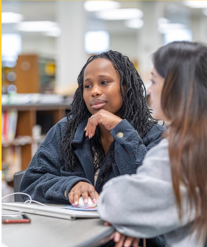
Peer Mentoring & Study Labs