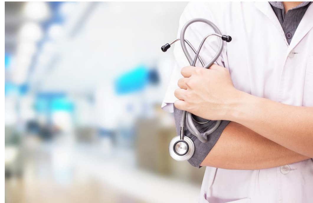
Doctor's Urgent Care