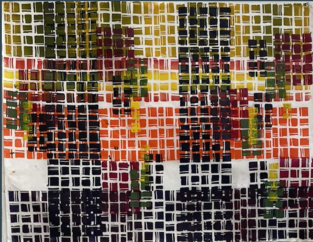
Julia Collado, Follow the Brick Road , Soy