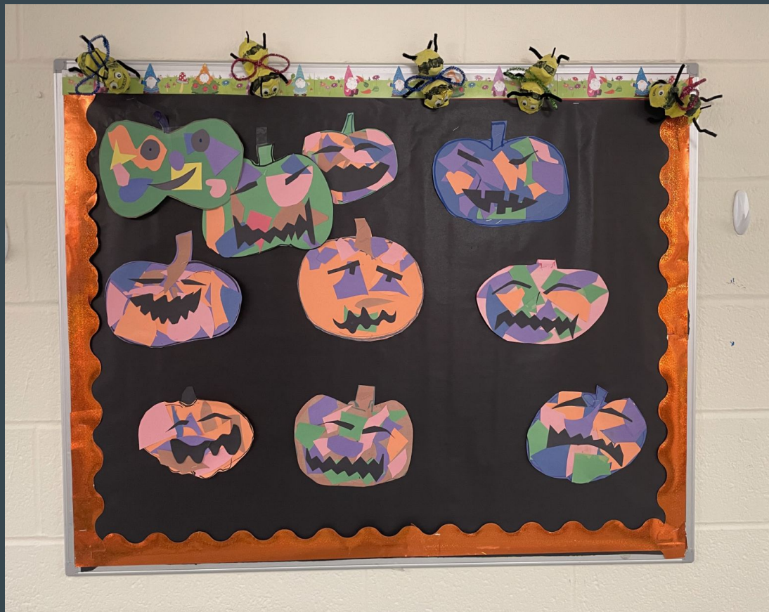
Julia Collado, Jack-together , color paper, unknown size