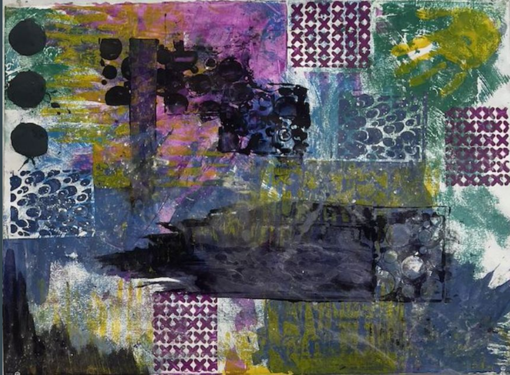
Julia Collado, Blossom raindrops , watercolor and soy inks, 22" x 30"