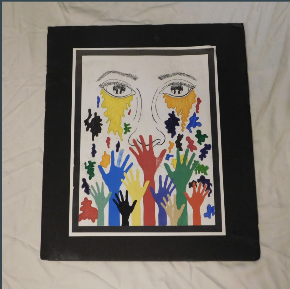
Julia Collado, Tears , drawing and paper,